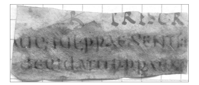
Fig. 2 FLA 1B, showing rubricated title in line 1

So what are the key "diagnostic" features of the London fragments as we try to make sense of what they might be? First, as just noted, on the basis of the palaeography, a fifth-century date for the fragments is reasonable. Secondly, the language of the fragments is either legal or otherwise consistent with this being a law-work. Thirdly, given that the glosses in Greek suggest that the original manuscript was most likely used in a Greek-speaking area and so probably in the eastern portion of the empire, it is also likely that the manuscript was copied there as well. In that case, the heavy use in the fragments of abbreviations typical of early legal manuscripts means that the London fragments must have been written before the ban upon such