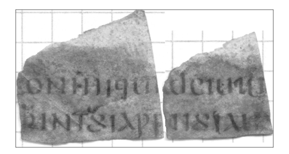
Fig. 4 FLA 15B and 5A adjacent: the rescript to Neo

Example 3. FLA 15B + 5A (Fig. 4) and 4A (with restorations based on C.7.62.7)